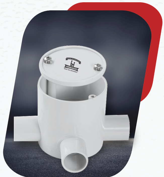
Deep Junction Box