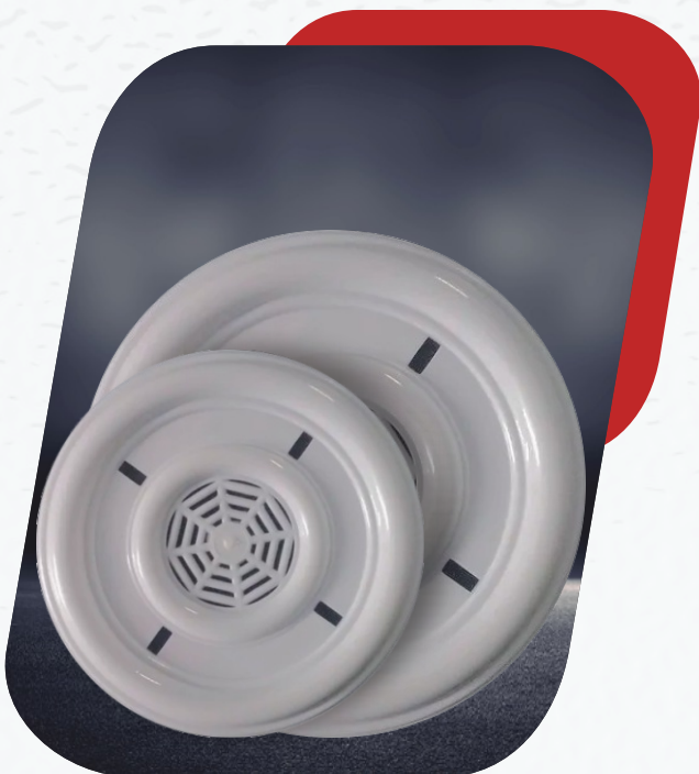
Fan Sheet Round Sheet

PVC Conduit Accessories that we offer is available various sizes and is used in various small and large scale organizations and other engineering applications. These are available in black, grey and white color and are available in various dimensions.